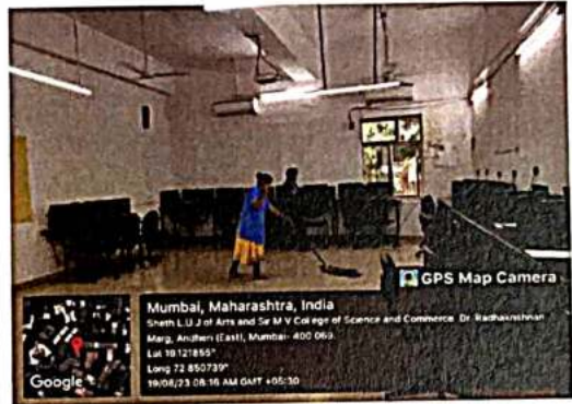
BAMMC Lab Cleaning