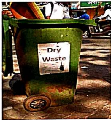
DRY WASTE BIN