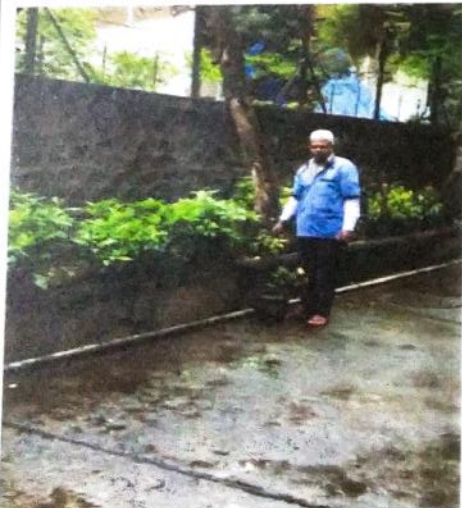
Gardener On Duty