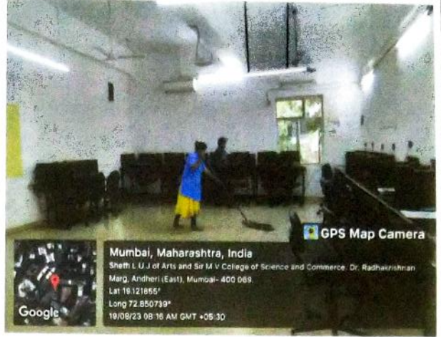
BAMMC Lab Cleaning