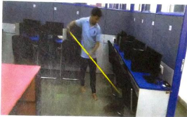
IT Lab Cleaning