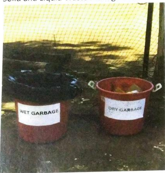
Solid and Liquid Waste Management