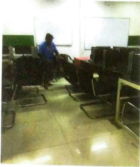
CS Lab Cleaning